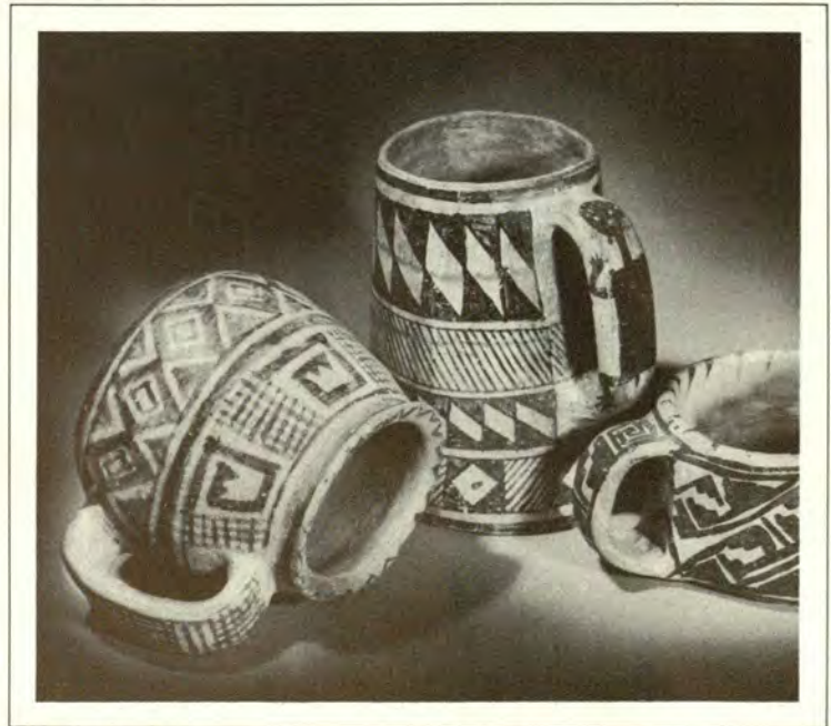
Pottery from Mesa Verde circa AD 1100-1300.

So the question remains, and every Hopi I have ever asked has known the answer. No matter the generation, the clan, or the college degree, the certainty never wavers. From the time humankind emerged from the Sipaapuni , it was the Life Plan of the Creator that the Hopis would migrate in all directions across the continent, and be drawn together again here at the Center, and live here in the Hopi Way until the Fifth World begins. That is the prophecy. That is the answer.