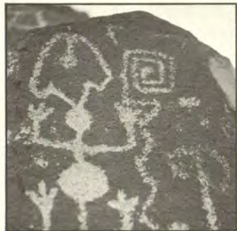
Petroglyphs, Nuvakwewtaqa.