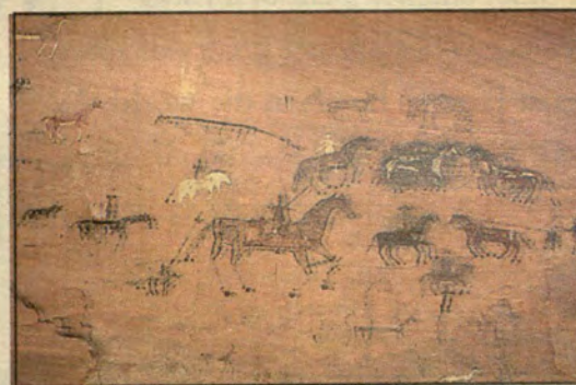
Pictographs in Canyon de Chelly.