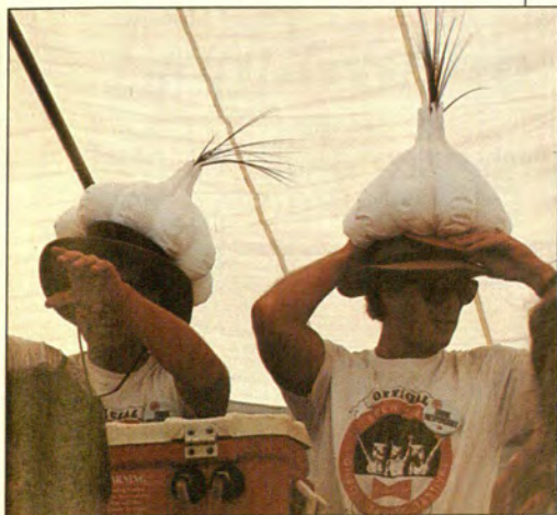
Stinking Rose, page 24