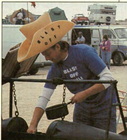
Viva Terlingua, page 18

SEPTEMBER/OCTOBER 1993 Volume VII, No. 5